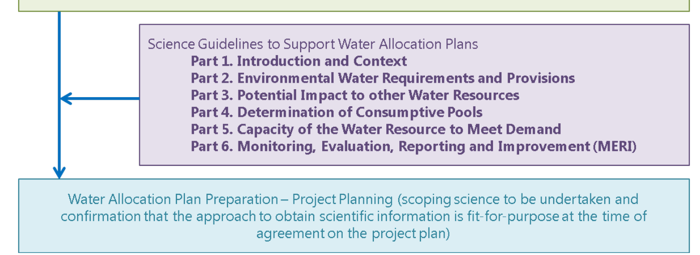
Figure 1. Context of how the Science Guidelines can contribute to the water allocation planning process

Risk Management Framework for Water Planning and Management and Risk Management Policy and Guidelines for Water Allocation Plans