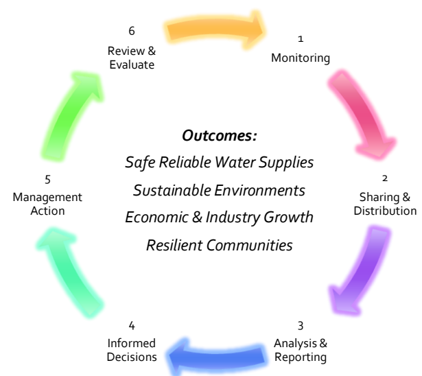
Diagram 2: Water monitoring plays a key role in informing the decision making process.

bodies. Their purpose is to provide a framework to inform and guide decision-making related to monitoring.