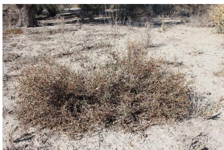
Spiny lignum prior to 2022 SA River Murray flood

In desperate need of water, the rare plant species spiny lignum ( Duma horrida ssp. horrida ) enjoyed a long drink during the flood event. These plants are being monitored on the Pike Floodplain and have responded with a flush of green in stark contrast with their pre flood yellow/brown appearance. In the following months, this species will be kept under observation to see if they set seed and/or send up new shoots from their rhizomes (root mass) underneath the soil.