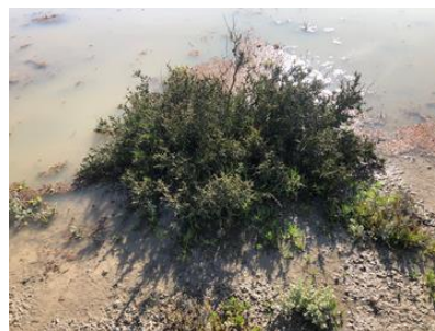
Spiny lignum after 2022 SA River Murray flood