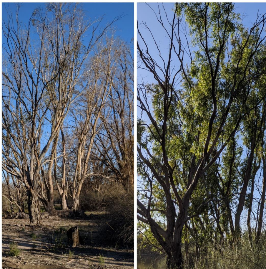
Figure 3: Photos of River Red Gums at Carpark's Lagoon on the Katarapko floodplain before and after environmental watering in 2020

During this time Katarapko is still open to the general public for visiting however please be aware of some current road and location closures and detours in place for some locations. Conditions within the creeks will vary with water speed, depth and area being covered on the floodplain. We ask that when visiting Katarapko care should be taken when driving, boating or canoeing. For more information on the Murray River National Park closures and updates please visit: https://www.parks.sa.gov.au/find-a-park/Browse_by_region/Murray_River/murray-river-national-park