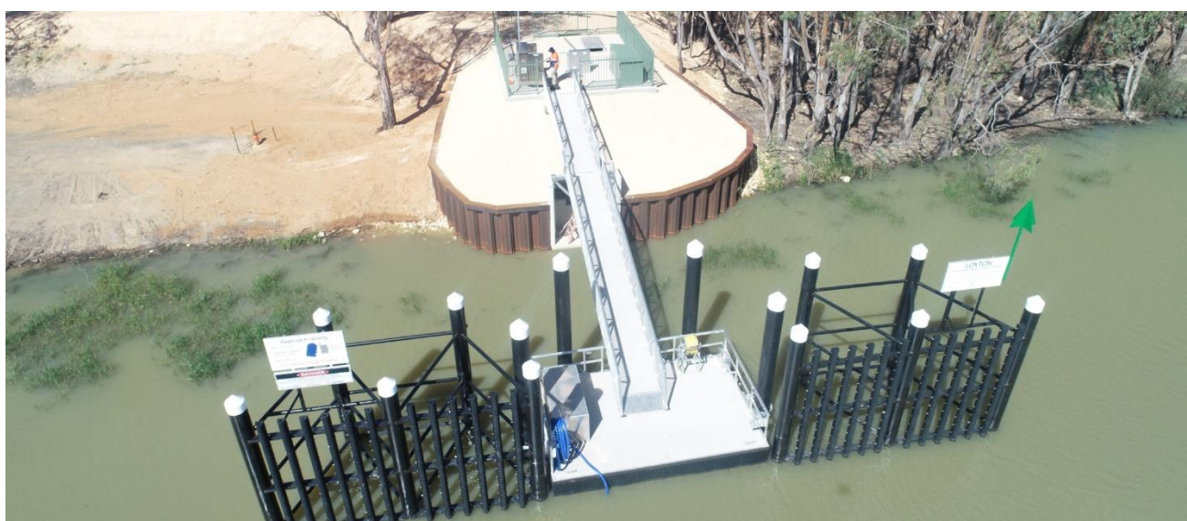
Figure 2: The recently upgraded Loxton River Vessel Waste Disposal Station

The Loxton River Vessel Waste Disposal Station upgrade is now complete and available for public use. If you need any other help or advice with regard to this station, please call Mr Hayden Smith on 0457 820 553.