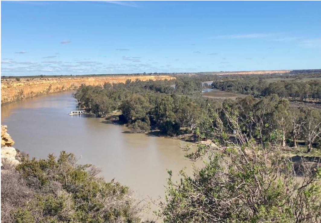
Figure 2: The River Murray at Big Bend (below Lock 1) in South Australia