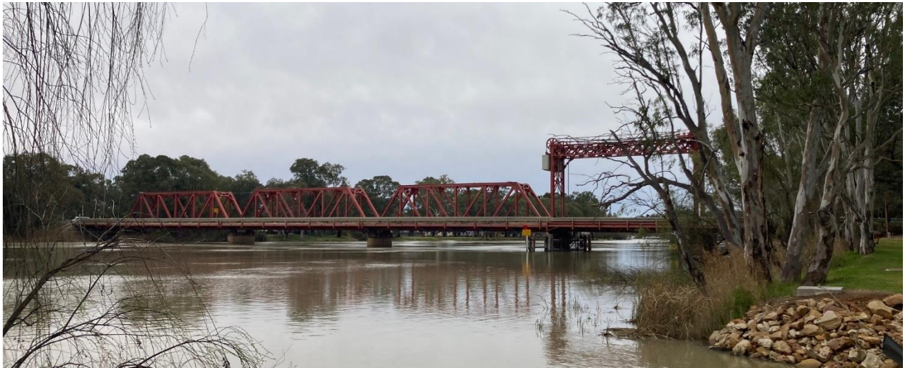
Figure 1: Higher water levels at Paringa Bridge

With flow at the South Australian border above 40 GL/day, the Department for Environment and Water has issued a High Flow Advice with this River Murray Flow Report and Water Resources Update. The High Flow Advice is also available on the DEW website at the following location: https://www.waterconnect.sa.gov.au/River-Murray/SitePages/River%20Murray%20Flow%20Reports.aspx