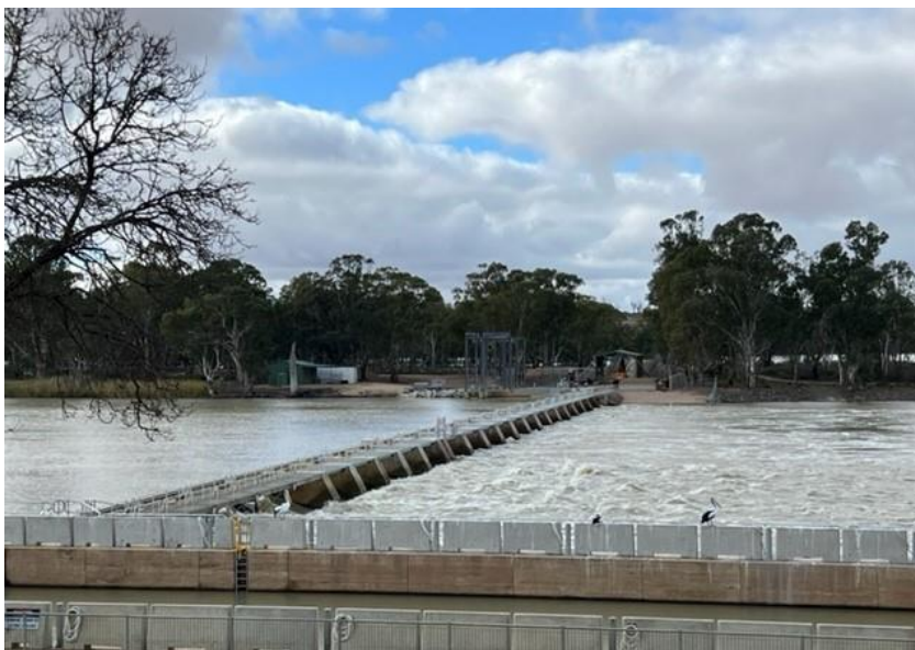
Figure 1: Higher flows passing Lock and Weir 1 at Blanchetown SA

The flow over Lock 1 is approximately 40 GL/day and will increase to around 42 GL/day over the coming week.