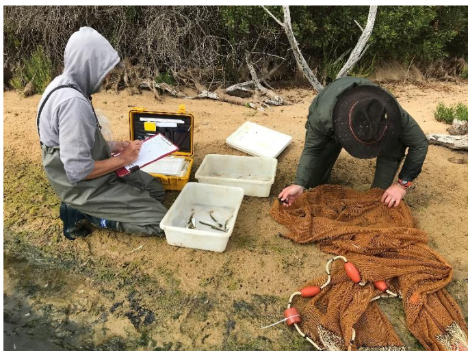
Figure 1: SARDI Aquatic Sciences staff monitoring black bream in the Coorong

Coorong fish monitoring is managed by the Department for Environment and Water, and funded by The Living Murray program, a joint initiative of the New South Wales, Victorian, South Australian and Commonwealth governments coordinated by the Murray-Darling Basin Authority.