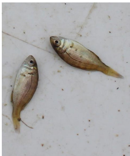
Figure 2: Baby black bream found in the Coorong (A. Rumbelow)