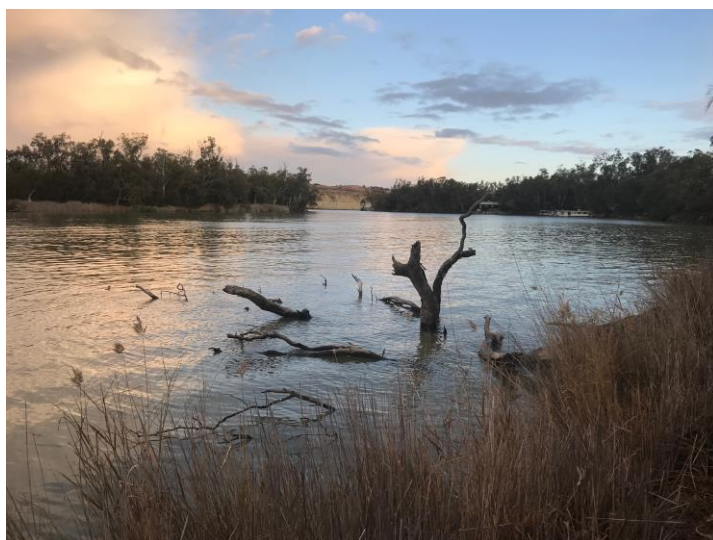
A natural snag in Morgan

An emerging collaboration between government, private business and the community is set to deliver another big win for the River Murray with the Department for Environment and Water's (DEW) successful re-snagging initiative being rolled out again in 2022. Read more about this story on Environment SA News .