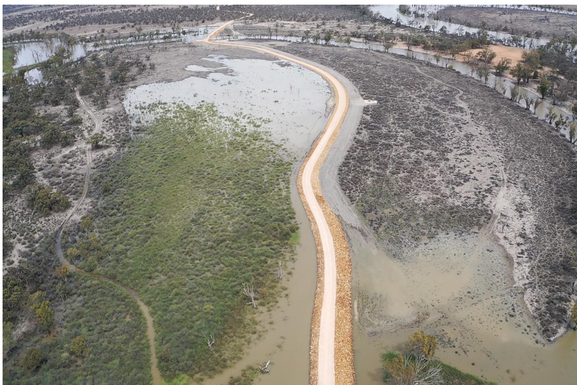
Figure 1: Environmental water on the Pike Floodplain (Richard Walsh, DEW)