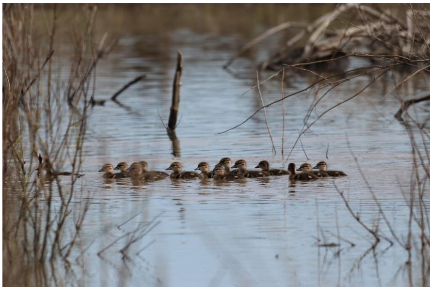
Figure 2: Pacific Duck chicks on the Pike Floodplain

The Lock 5 weir pool is temporarily raised by 50 cm to 16.8 m AHD in conjunction with the Pike floodplain watering to assist water flow through the floodplain. Over the coming weeks the Department for Environment and Water plans to start reducing the water levels slowly back to normal pool levels with monitoring occurring on a daily basis.