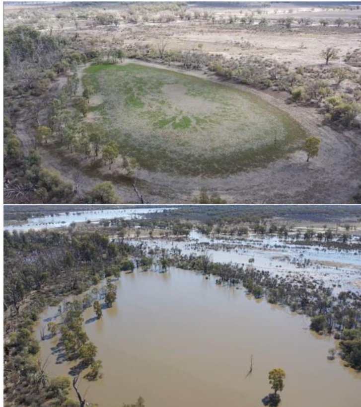
Figure 1: The Piggy Creek complex on the Katarapko floodplain, before and during the current environmental water operations