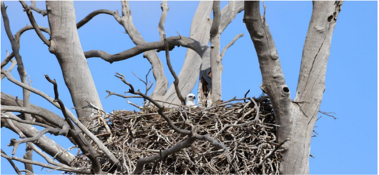
Figure 2: A Wedge-tailed Eagle in its nest on the Pike floodplain