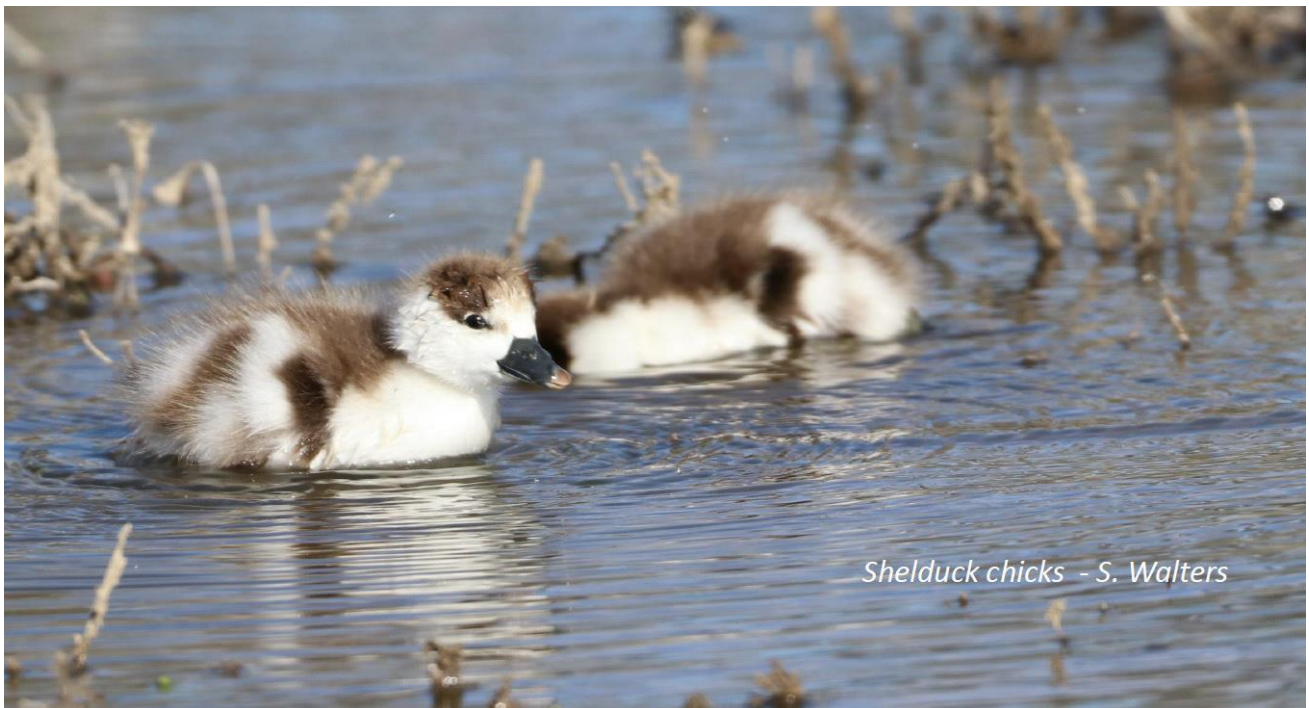
Shelduck chicks - S. Walters