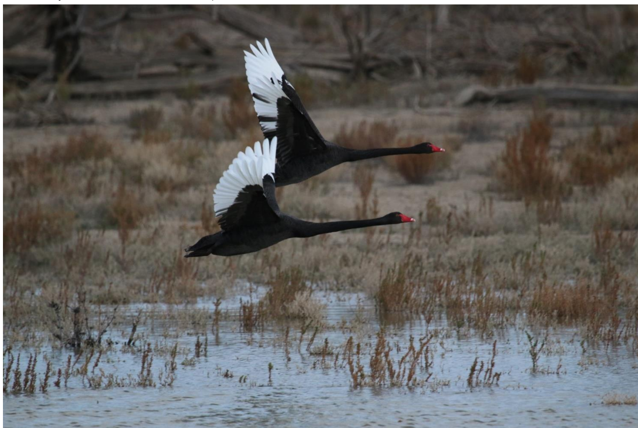
Figure 1: Black Swans flying over the Chowilla Floodplain