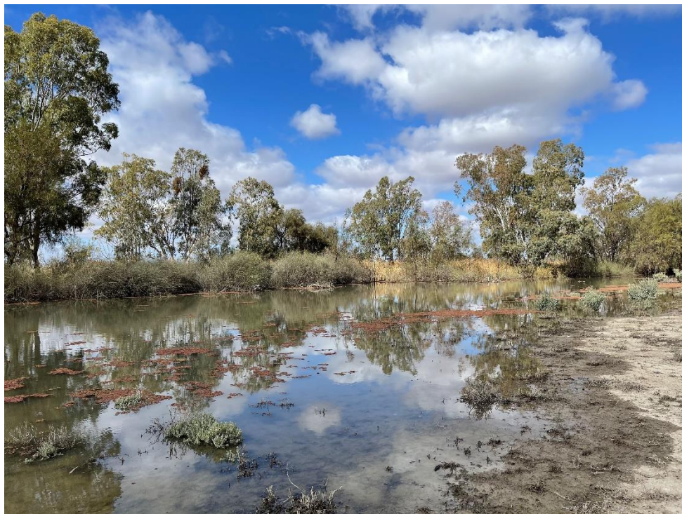
Figure 2: Water for the environment spreading over the Pike floodplain during current operations