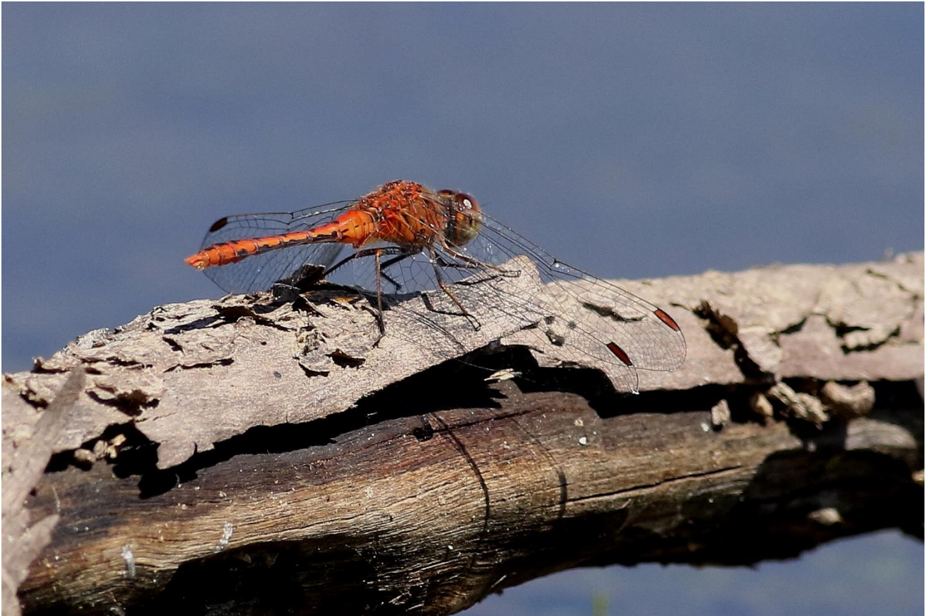
Figure 1: A dragonfly at Werta Wert on the Chowilla Floodplain