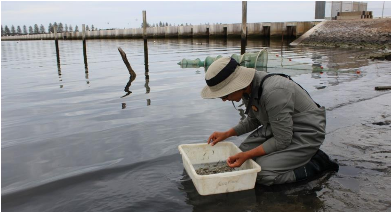
Figure 2: Sampling mudflats near the Goolwa Barrage (Healthy Coorong, Healthy Basin)