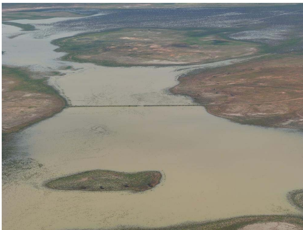
Figure 3: Yantabangee Lake

The NSW Office of Water has indicated the chance of localised flooding at Menindee and the Lower Darling River is now very low because of the smaller than expected volumes reaching Menindee, and the pre-releases from Menindee during February 2010. The volume of water currently held in Menindee Lakes is 1,026 GL (59% capacity). The Menindee Lakes system is now under the control of the Murray-Darling Basin Authority. Control of this system will revert to NSW if its volume drops below 480 GL.