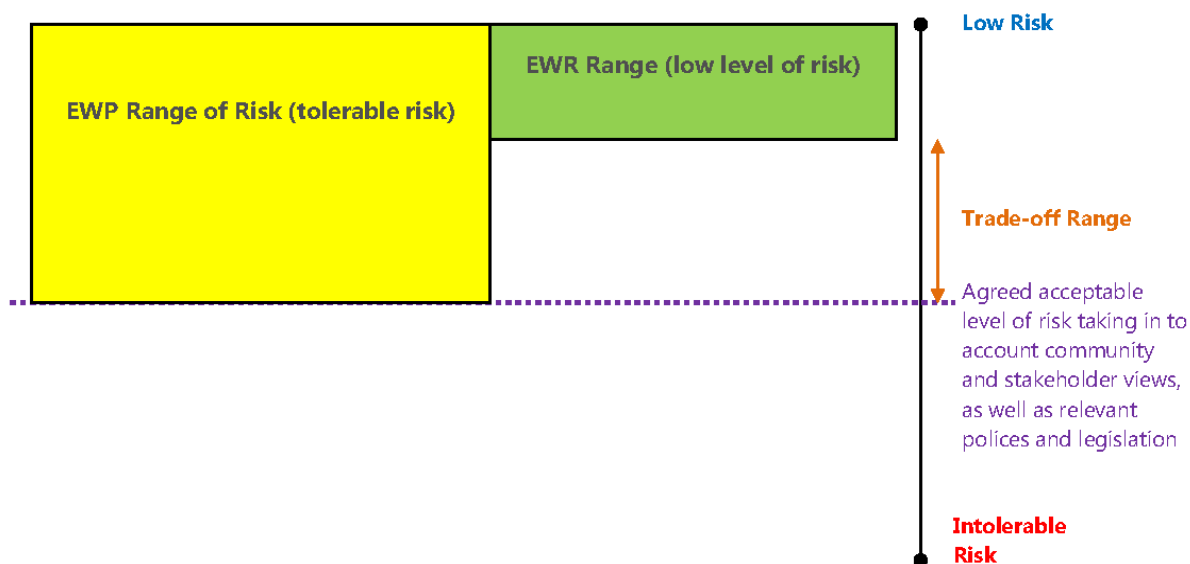
Figure 1. Conceptual diagram of the process undertaken to determine Environmental Water Requirements (EWRs) and Environmental Water Provisions (EWPs) for environmental assets