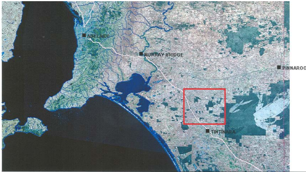
Figure 1. Tintinara-Coonalpyn model domain (red)