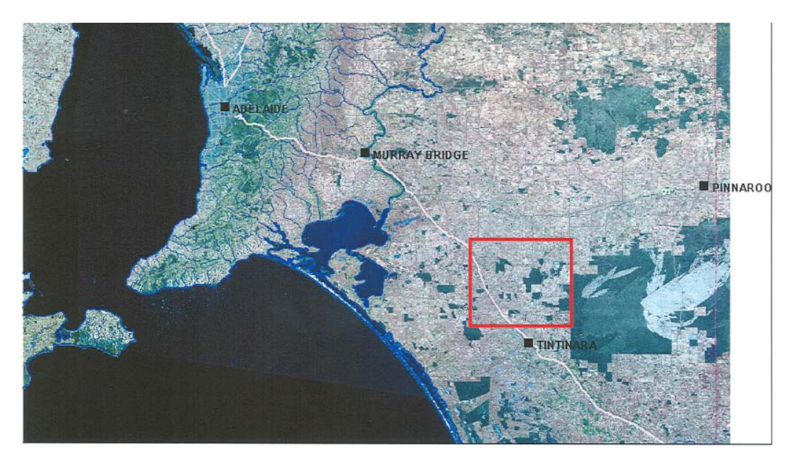
Figure 1. Tintinara-Coonalpyn model domain (red)